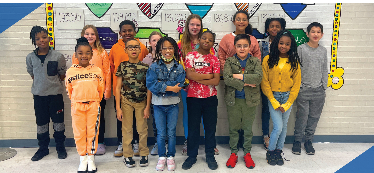
Lawson Elementary's Head of House students pose for a picture.