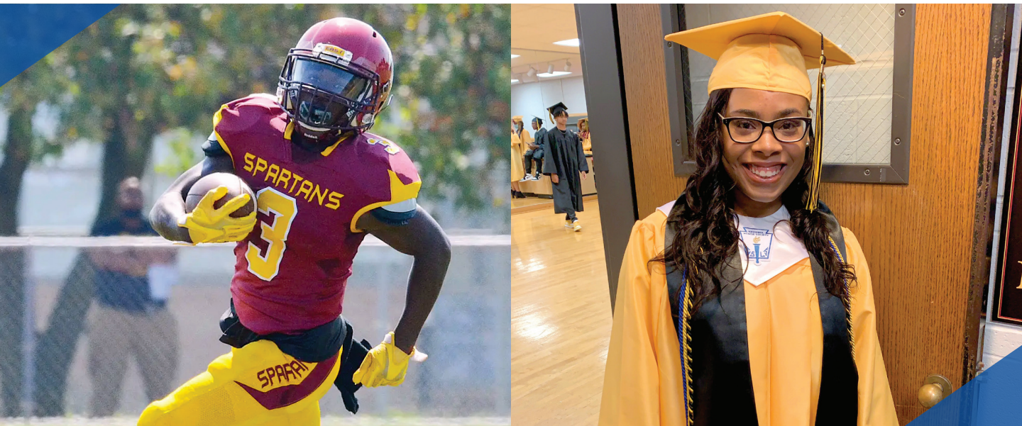
Hazelwood School District students excel athletically and academically.

Director of Federal Programs and Special Projects