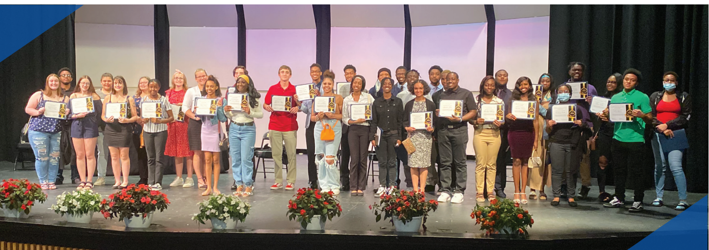
Hazelwood High School Scholars