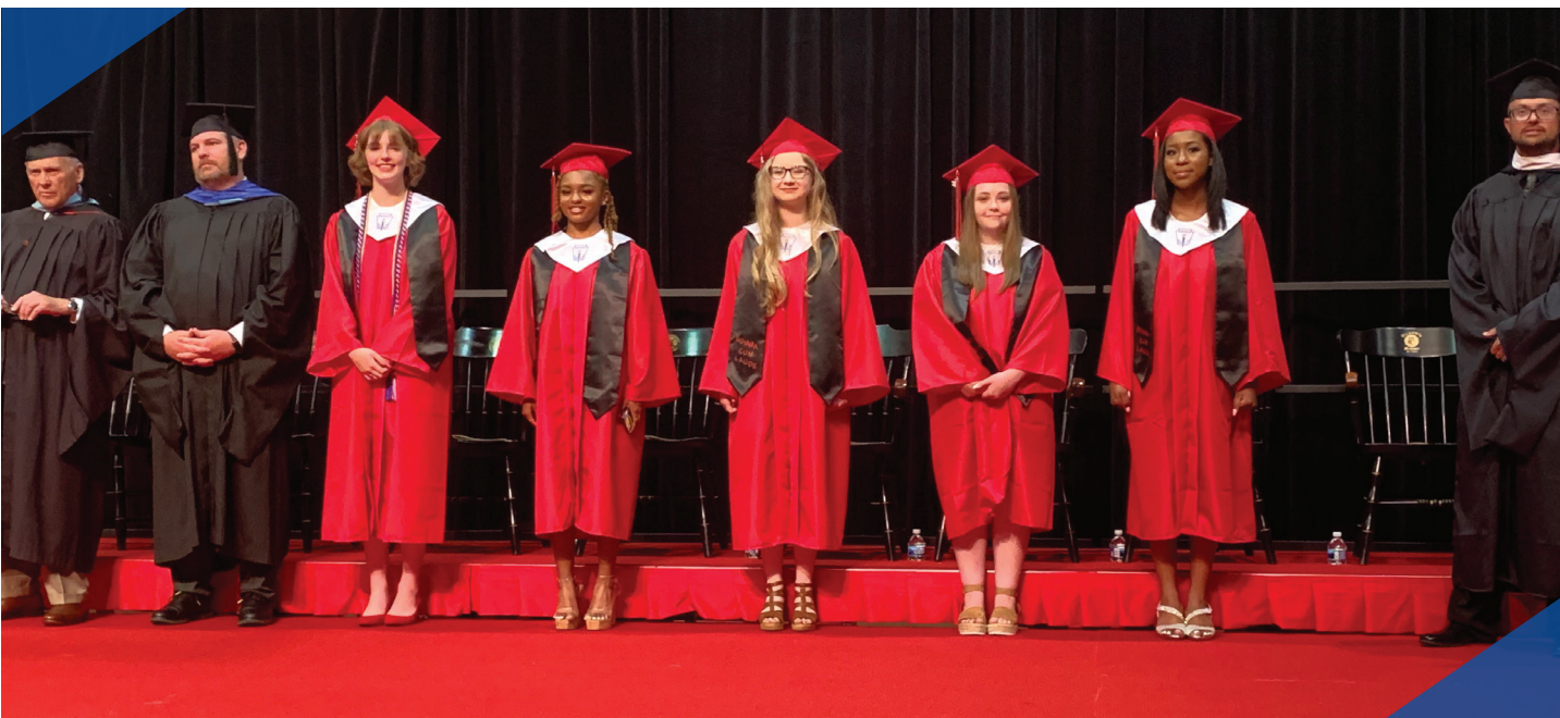
Graduation day for Hazelwood West High School

The Hazelwood School District provides great opportunities for students, faculty, staff, and parents to explore and develop understanding, skills, and capacities that support life-long learning, high achievement, and global citizenship for students. Our high expectations for all students are embedded in our districtwide goals, focus areas, and strategic priorities listed below.