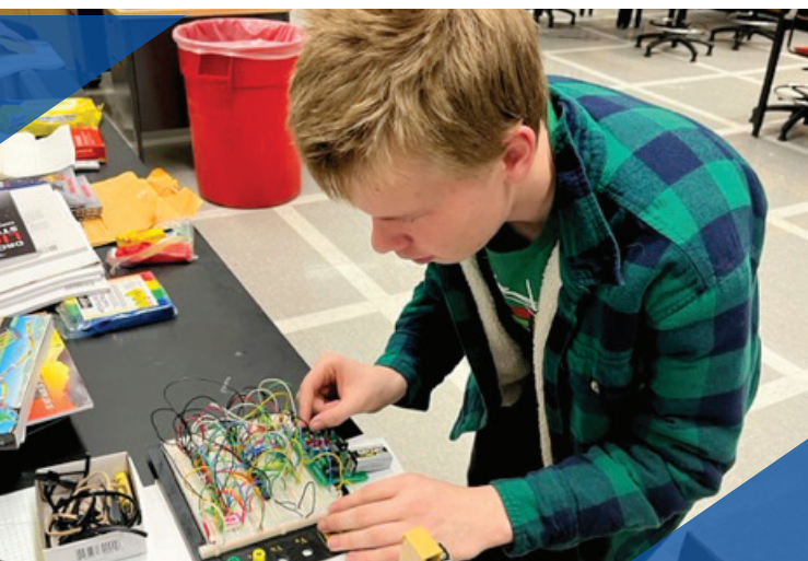
Hazelwood student engaged in robotics.