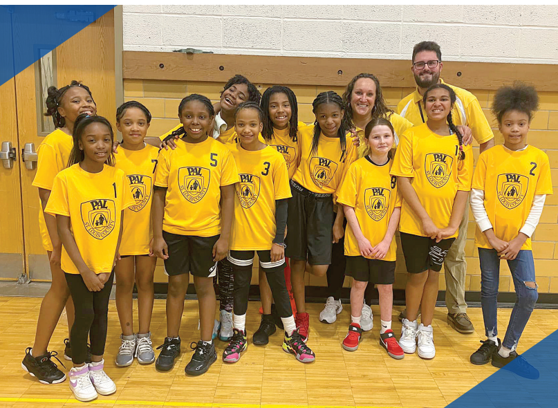
Walker Elementary's girls' basketball team after an exciting game.